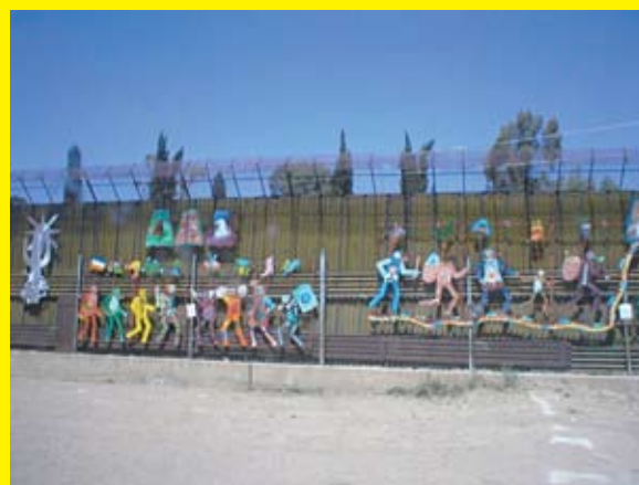
A section of the wall that separates Mexico from the United States. People on the Mexican side have decorated the wall with hopeful figures, minimizing the harshness of the wall.

Ephesians 2:14 – “...for Jesus is our peace, who has made us both one, and has broken down the dividing wall of hostility.”